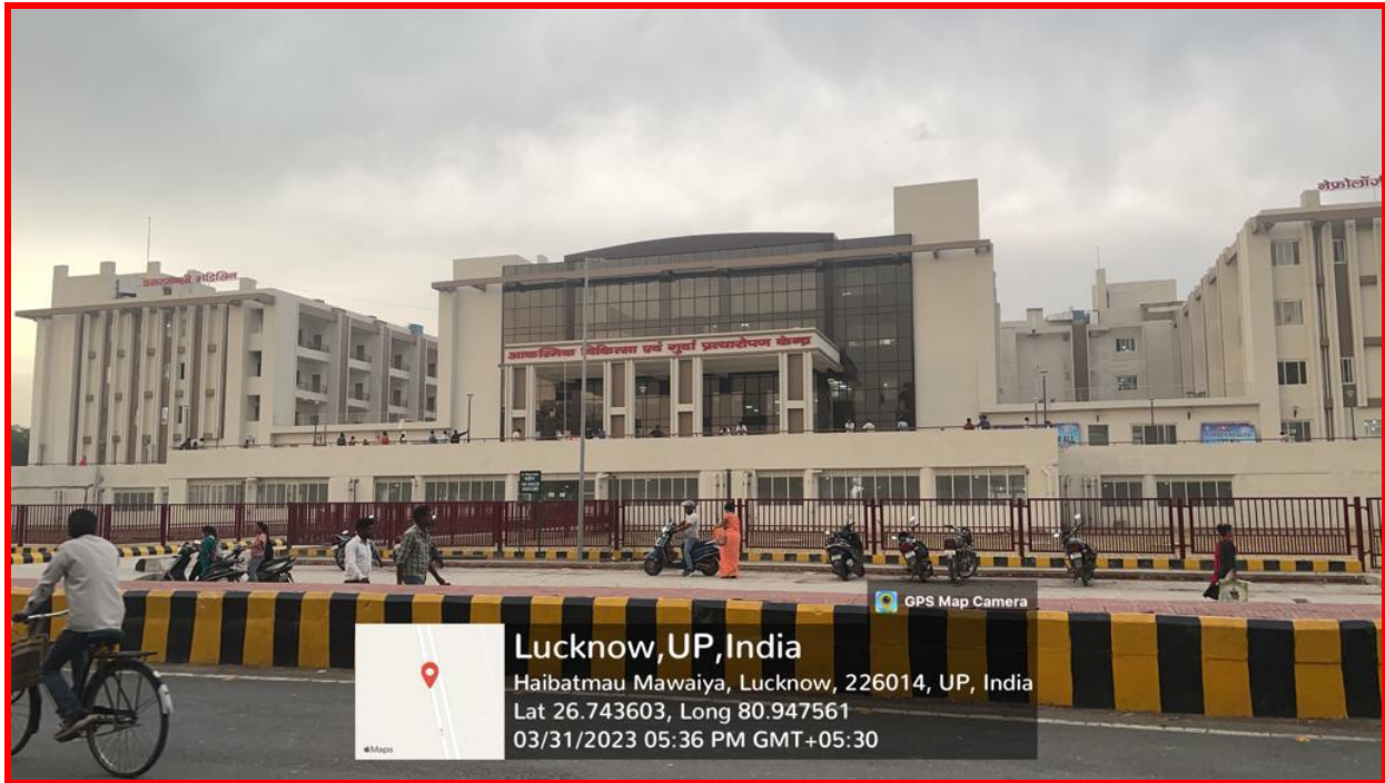
Emergency and Renal Transplantation Centre