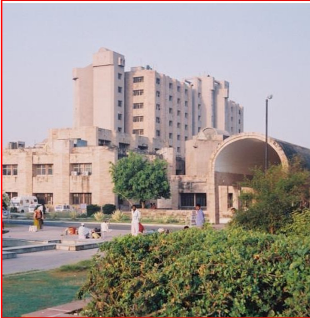
Main Hospital Building